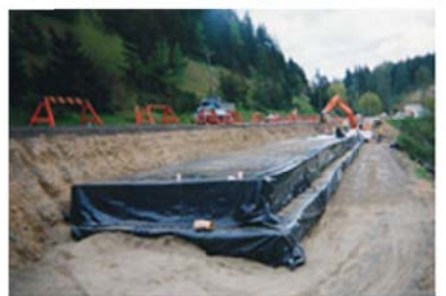
Figure 3 - Installation of GeoSpec Lightweight fill Material